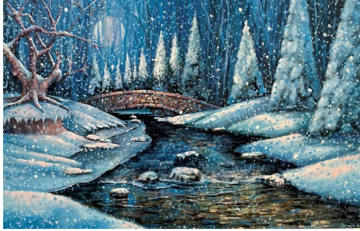
“Nutcracker: Snow Scene” Gouache on Illustration Board Image Size: 18” x 28” Framed: 30.5” x 40.5”

The original story of the “Nutcracker” was written by E.T.A. Hoffman in early 19 th century Germany. Hoffman lived part of his life in Bamberg, Germany and I had the good fortune to live in the same town for several years. When I was asked by Manassas Ballet Theatre to design sets for the “Nutcracker”, I tried to draw on some of my experiences from living in Bamberg.